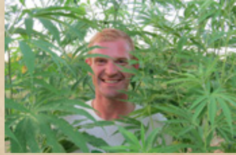
Middle Tennessee State University hemp field day