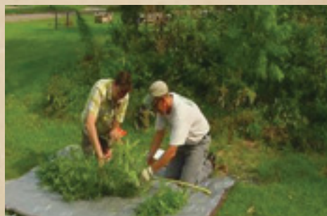
University of Minnesota