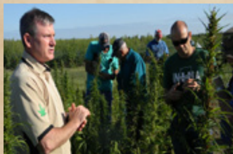
Purdue University hemp field day