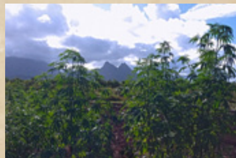
University of Hawaii 60 day old hemp crop - July 2015