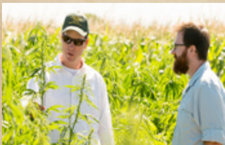
Colorado State University