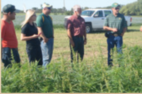
North Dakota State University hemp field day