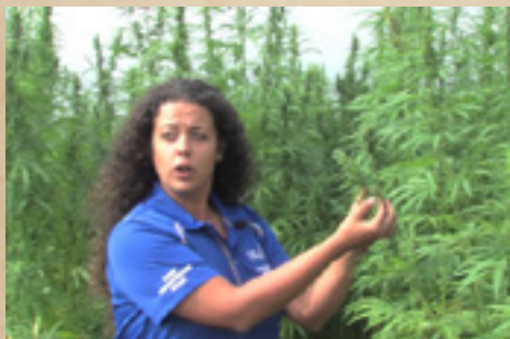
University of Kentucky hemp field day