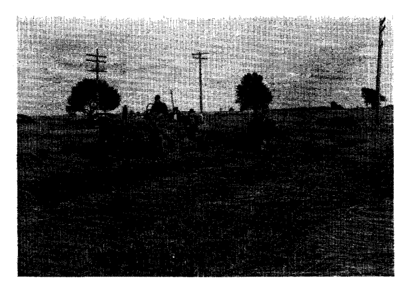
Fig. 4. Picking up and binding hemp near Waupun, Wisconsin, after field retting has been completed.

or "picker." This binder, like the harvester, is owned by the processor and is sent from farm to farm.