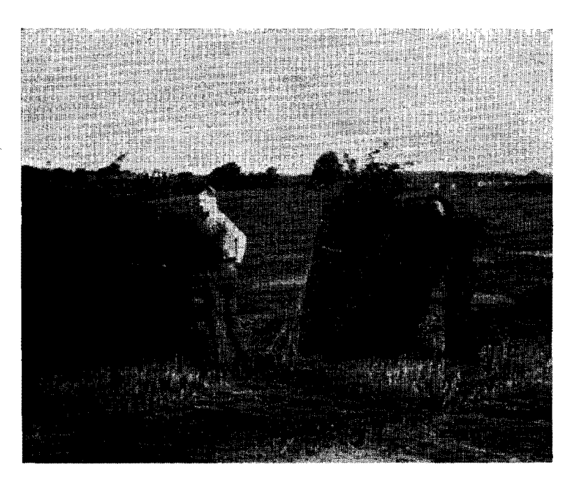
Fig. 3. After the upper surface has retted, the hemp straw is turned over to hasten the completion of the process and keep the retting uniform.

accordingly, the stalks are turned over once in the field in order to obtain uniformity in retting. In the past this has been a hand operation, but it is anticipated that simple machines may be perfected to do this now that a large acreage is involved. One man by hand can turn about 3 acres of stalks per day.