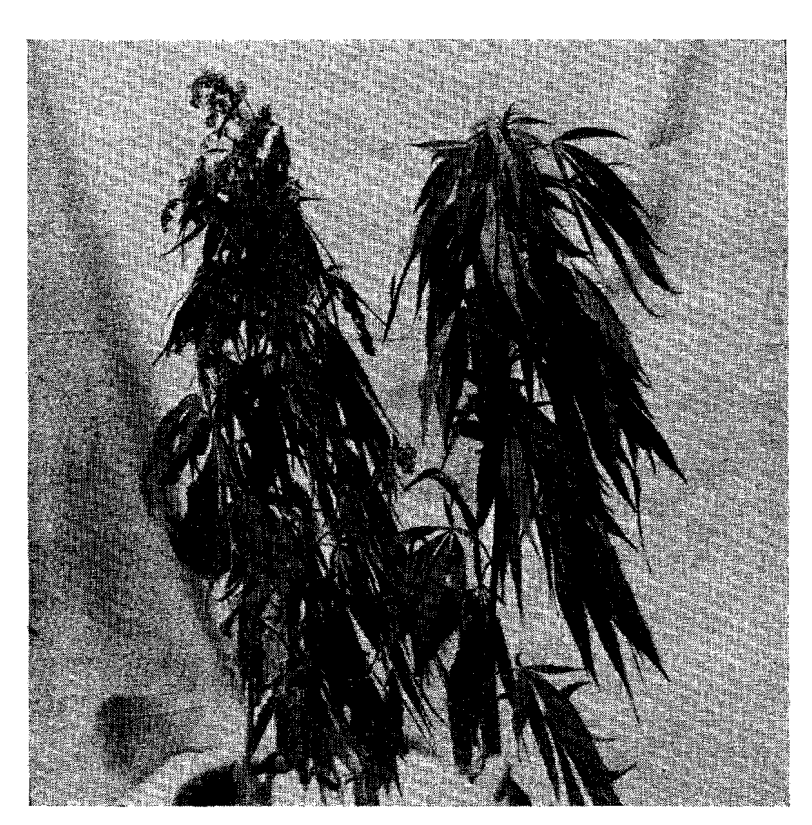
Fig. 1. Tops of hemp plants at the flowering stage. Male plant at the left and female at the right.

Steps have been taken looking to the construction of 15 mills in as many different locations in Iowa, each mill to process the hemp from about 4,000 acres. Because of the nature of the crop, hemp can be grown profitably only when a processing mill is located in the immediate vicinity of production.