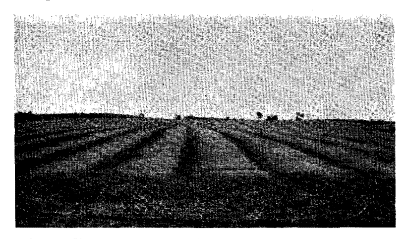
Fig. 2. Hemp lying in the swath near Brandon, Wisconsin, as spread by the harvester for retting.

On the fertile, prairie soils in Wisconsin, hemp produces about 10 to 12 tons of green stalks, or 2 to 3 tons of dry, retted stalks per acre. Preliminary experiments in 1942 at Kanawha, Iowa, and at Ames have indicated that yields equal to or greater than those reported for Wisconsin may be expected on the better soils in north central Iowa.