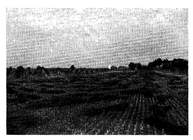
Fig. 5. The retted hemp after being bound in bundles by the gather-binder is shocked in the field until stacked or hauled to the processing plant.