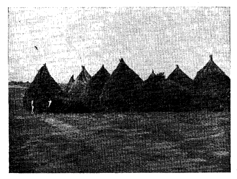
Fig. 6. After being shocked in the field, hemp is stacked on the farm or in the stack yard adjacent to the processing mill.

The waste hurds are burned for fuel to supply heat for the dryer and some or all of the power for the mill. Some