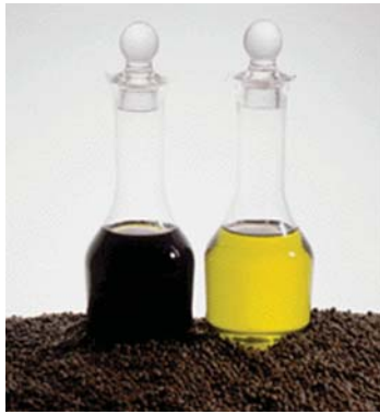
Hemp is Nutritious & Delicious

detrimental to our blood cholesterol balance. To avoid conversion of polyunsaturated fatty acids to unhealthy peroxides at higher temperatures, hemp oil and nut are best used for cold and warm dishes where temperature is kept below the boiling point (212° F). Hemp oil should not be used for frying. When using it for light sautéing, keeping the pan