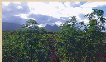
University of Hawaii 60 day old hemp crop - July 2015