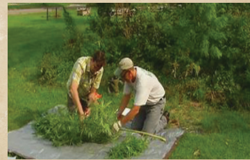
University of Minnesota

Amends for policy & changes Introduced for 2016