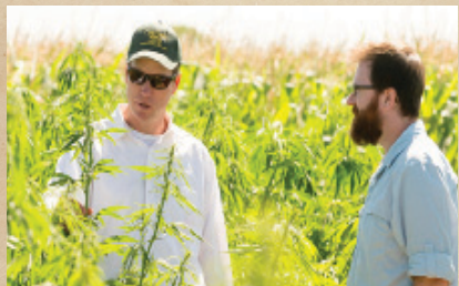
Colorado State University