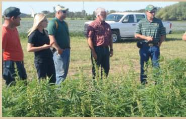
North Dakota State University hemp field day