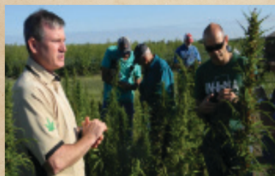
Purdue University hemp field day