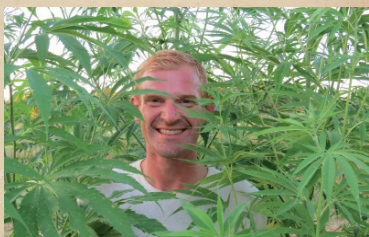
Middle Tennessee State University hemp field day