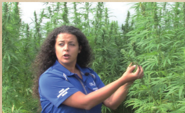
University of Kentucky hemp field day